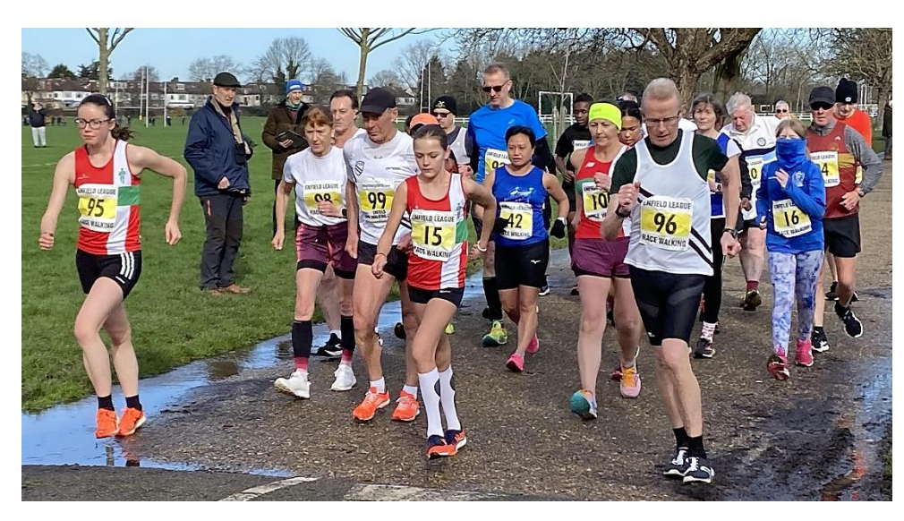
ERWL 2024 Fixture 2 gets underway